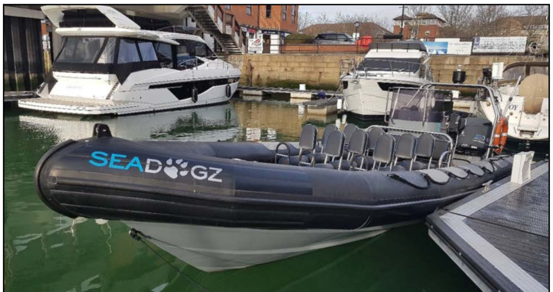
Figure 1: Seadogz

Seadogz Rib Charter Ltd owned and commercially operated two rigid inflatable boats (RIB), Seadogz (Figure 1) and Jack Black . The company offered a range of excursions using the boats within the Solent area, which included: Extreme RIB Experiences , Treasure Hunts , Corporate Team Building Events , and trips for Stag and Hen parties. Seadogz was approved to operate in area Category 4 1 , and its compliance with The Small Commercial Vessel and Pilot Boat Code of Practice (SCV Code) was verified by the Yacht Designers and Surveyors Association, a Maritime and Coastguard Agency (MCA) approved certifying authority.