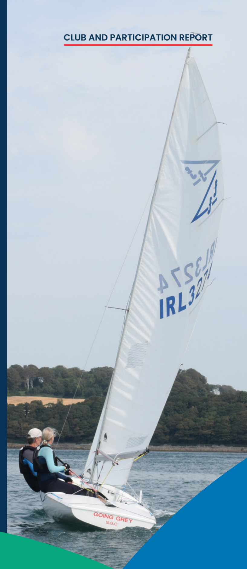
SSC - Adult Dinghy Sailing

Read the news article for promoting the event here .