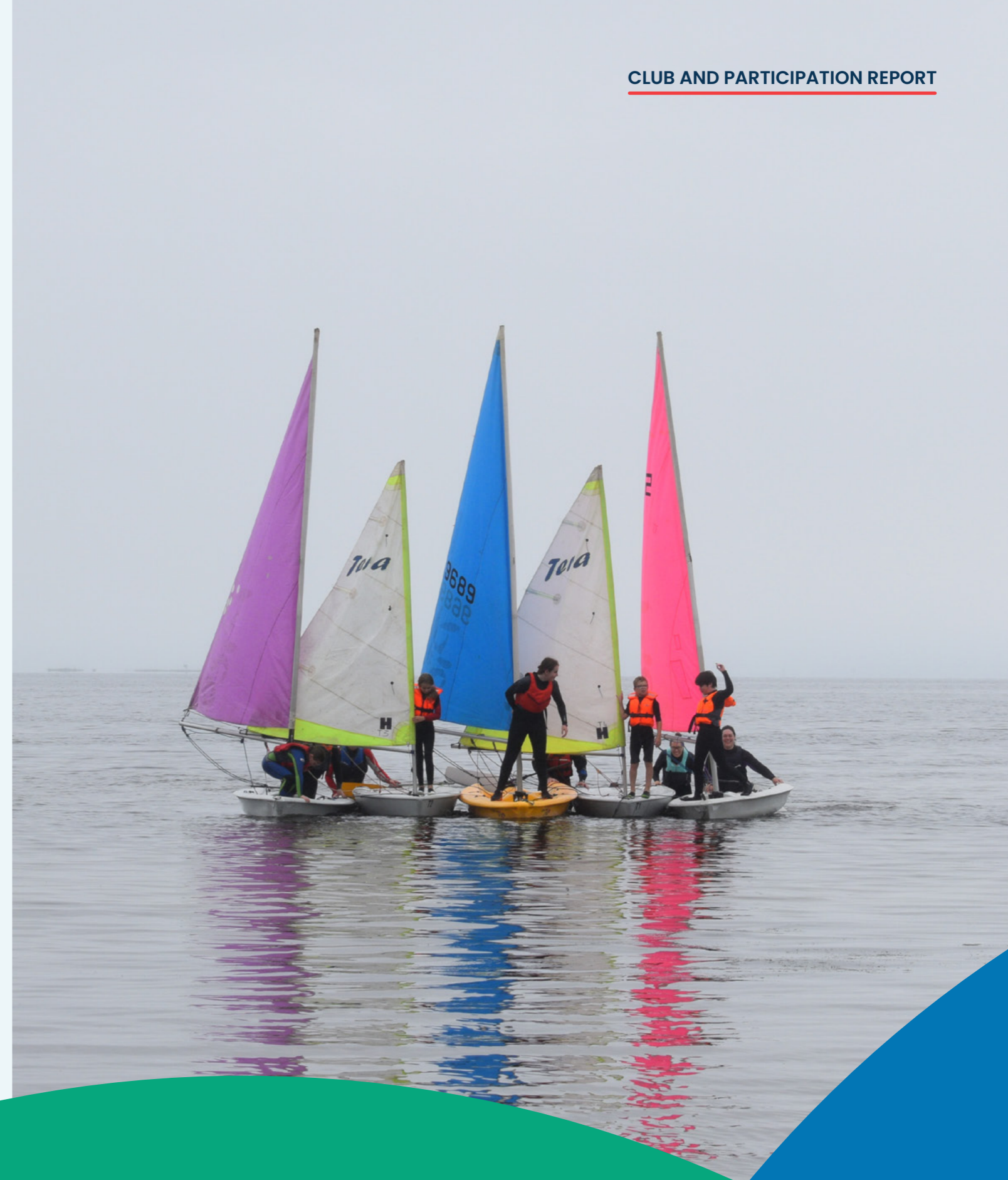
Ballyronan Boat Club – Wacky Races

Recognising the outstanding achievement of sailing clubs, the award highlights the hard work and dedication that goes into running a successful club.