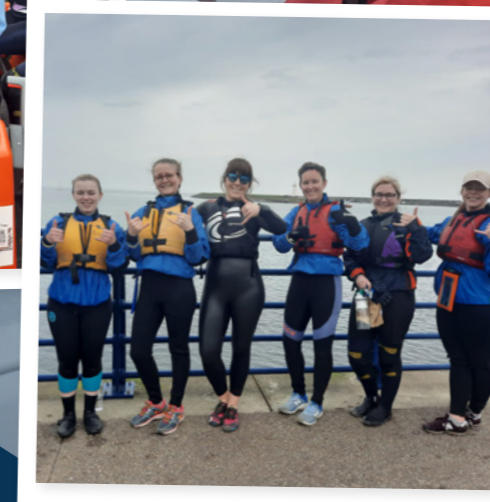
CAYC Skills Refresher