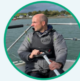
Greg Yarnall CEO

Having taken up the role of CEO in September 2022, it has been an absolute privilege to lead the organisation and help launch the new strategic plan, Navigating the Future in March 2023.