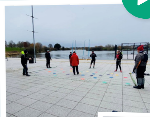
Onboard development day