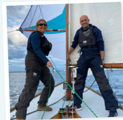
Getting a taste for racing!