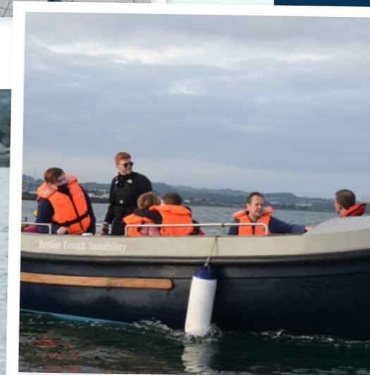
Belfast Lough Sailability Club

“ I hope to get more involved with coaching and training this season as I couldn't be on the water last year for various reasons. The club will hopefully use the new techniques to encourage more of our sailors to continue to participate. ”