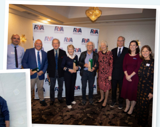
Navigating the Future Strategic Plan launch evening

The new strategy had been shaped by the whole of the Northern Ireland sailing and boating community and we are grateful for the input at various stages of its development. There are four strategic aims where we will be focusing our efforts and time, alongside five strategic foundations that support and underpin the work we do to achieve these strategic aims.